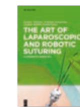
The Art of Laparoscopic and Robotic Suturing DE GRUYTER