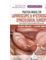
Practical Manual for Laparoscopic and Hysteroscopic Gynecological Surgery, 3 rd Edition , Jaypee Brothers