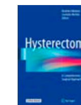
Hysterectomy – A Comprehensive Surgical Approach , A step-by-step, well-illustrated surgical description of all hysterectomy techniques with many interdisciplinary aspects, Springer Science